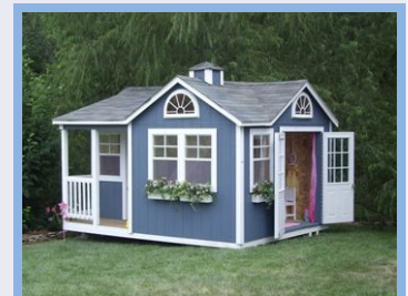
I wish to have...