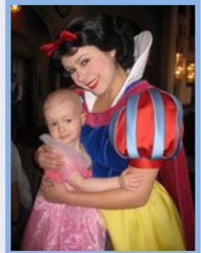
I wish to meet...

Average Wish Cost: The average cost to fulfill a wish is $6,000. All Wish expenses are fully covered by Make-A-Wish. We do not receive public funds for wishes. Donations come from individuals, corporations and foundations, schools, community fundraisers and gifts of products and services.