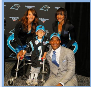
I wish to be...